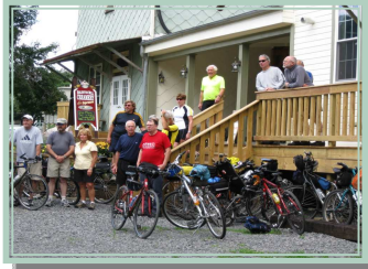
Encouraging Economic Development