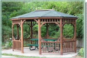
Maintenance & enhancements