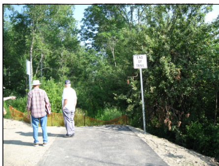
Clear Lake Authority - planning to continue north along East Branch Trail (& Erie to Pittsburgh Trail)