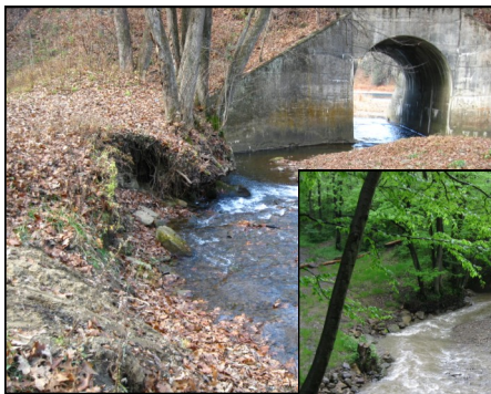
Allegheny Valley Conservancy - streambank restoration