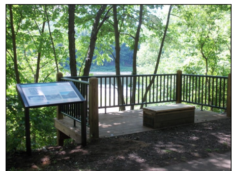
Allegheny Valley Conservancy scenic overlook & interpretive panels