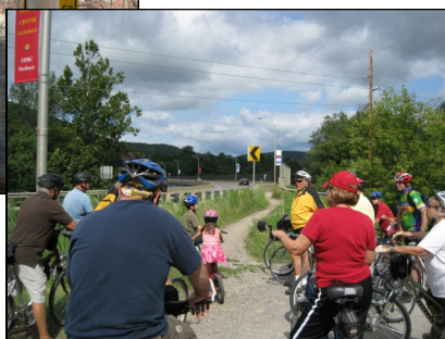
AVTA, Franklin - improving the route into downtown