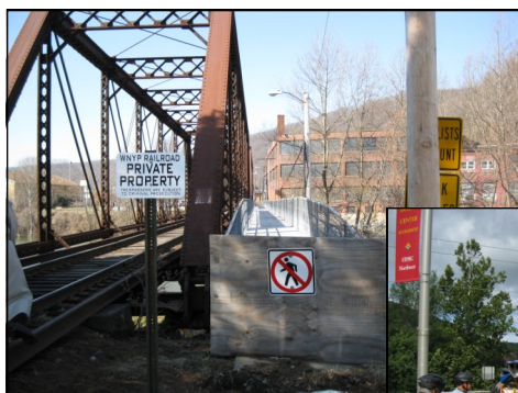
Oil City - starting trail crossing repairs